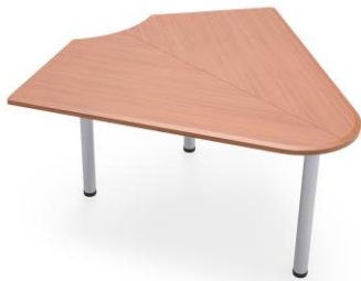
Code MFT6024-TT60 Triangle Folding Table Extension